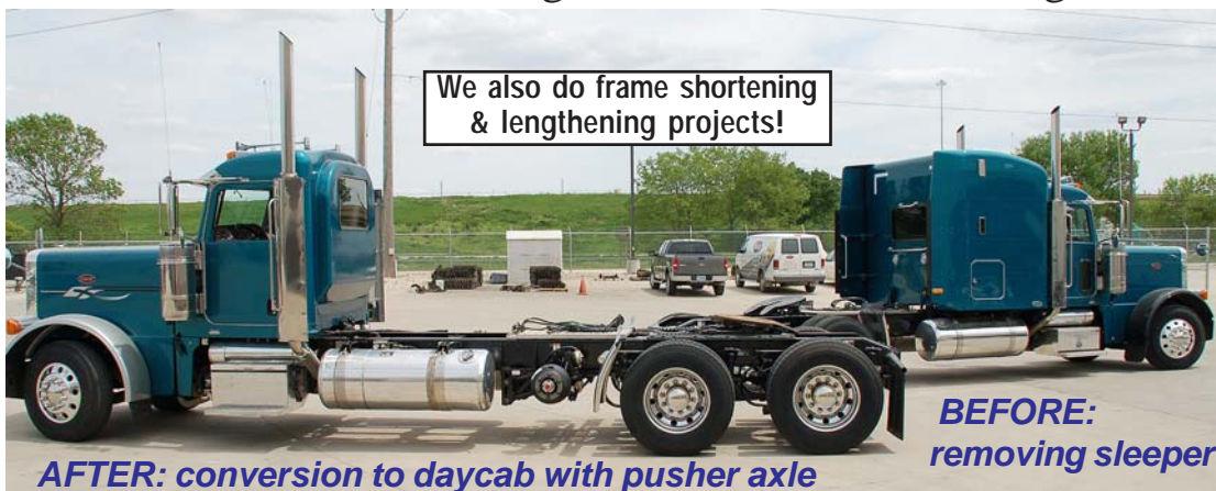
AFTER: conversion to daycab with pusher axle

Contact your Peterbilt Service Manager for a bid on your conversion project.